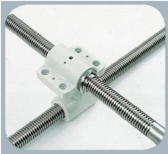
Unique backlash adjustable double nut design with oversize contact face for both enhanced rigidity and accuracy with easy backlash adjustment.